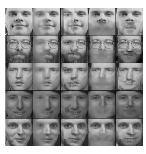
Figure 2: Example results on image completion of Caltech101 (left) and Olivetti (right) faces. From left to right in each column: (1) true face, left side predictions by (2) HL-MRFs and (3) SPNs, and bottom half predictions by (4) HL-MRFs and (5) SPNs. SPN completions are downloaded from Poon and Domingos (2011).

and Domingos (2011). Following their experimental setup, we hold out the last fifty images and predict either the left half of the image or the bottom half.